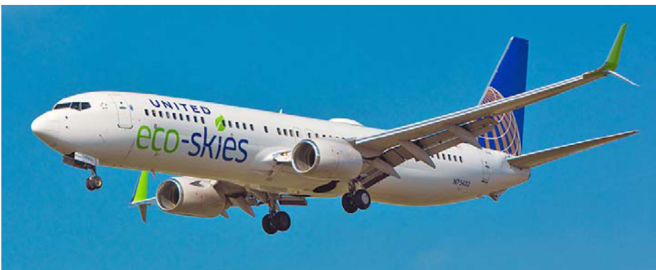
Top: Biofuel at LAX Bottom: Eco-Skies 737