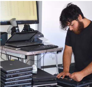
Top: Forklift training Bottom (Left to right): Solar-reflective roofing and HVAC upgrades; Computer refurbishing