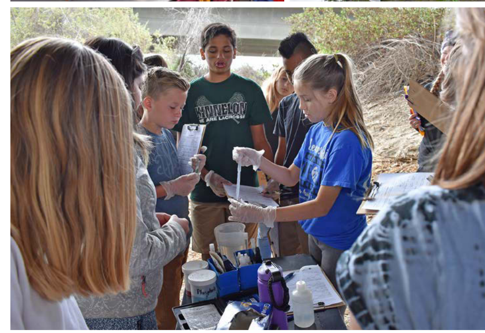
Top (Left to right): In-class presentation; Field trip Bottom: Student water quality testing