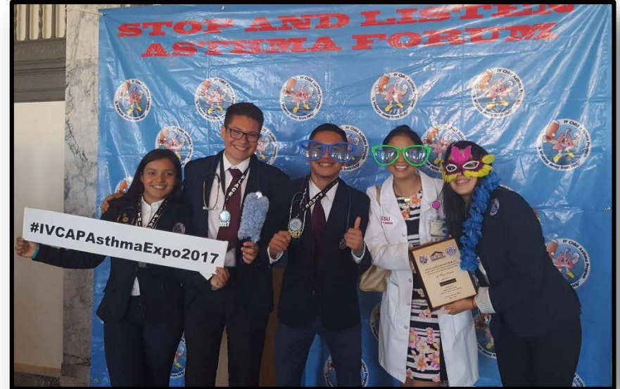
School competition winners celebrating at the Stop and Listen Asthma Forum for World Asthma Day.