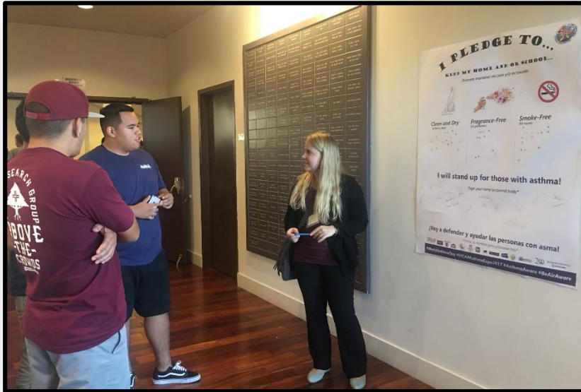
Pledging to reduce asthma triggers by keeping homes and schools clean, dry, and fragrance and smoke-free.