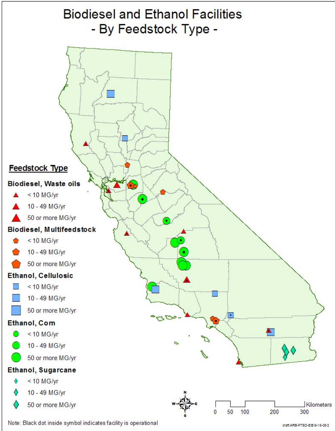
Figure J-2: Feedstocks of Known and Proposed Biodiesel and Ethanol Facilities 5