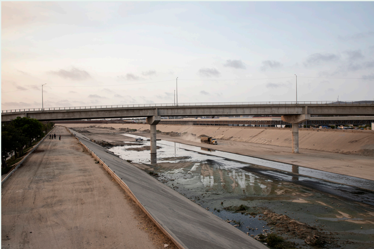
Cleaning and maintenance work on the Tijuana river gates that divides Mexico and the United States.

For Children's Health and Binational Health months, the U.S. EPA, NADB, and Western States Pediatric Environmental Health Specialty Unit collaborated on a virtual "Ask the Experts" bilingual webinar with over 240 views. They also launched public service announcements on air quality, wildfire smoke, and children's health, which reached over 700 viewers.