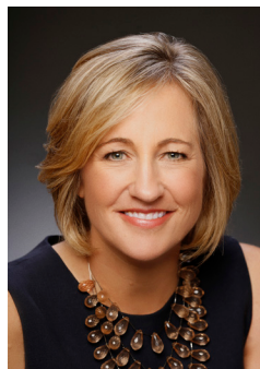
Dee Dee Myers

Director, Governor's Office of Business and Economic Development (GO-Biz)