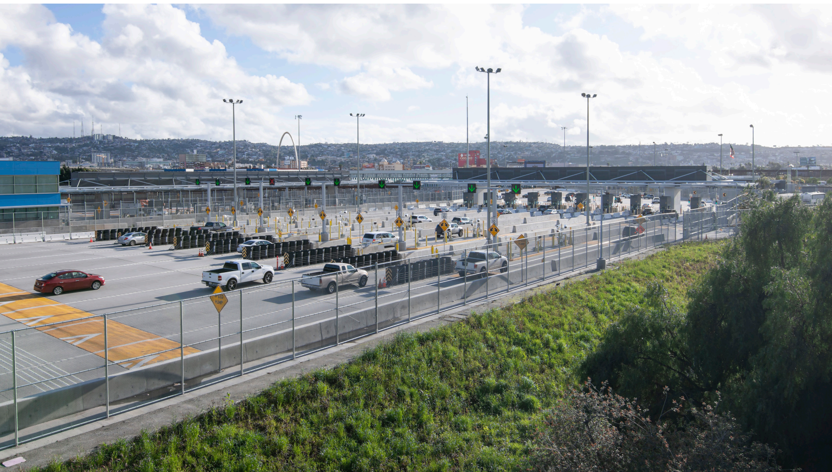
San Ysidro vehicle border crossing from USA to Mexico.

The driving force and focus of this program is the use of a CHP officer of Hispanic ancestry or officers that are bilingual and bicultural - known as the EI Protector Program Coordinator. The coordinator organizes community events, provides traffic safety education presentations and serves as a role model.