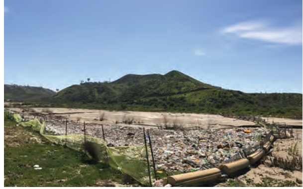
Goat Canyon lower trash boom.

netting. These upgrades are proving extremely effective.