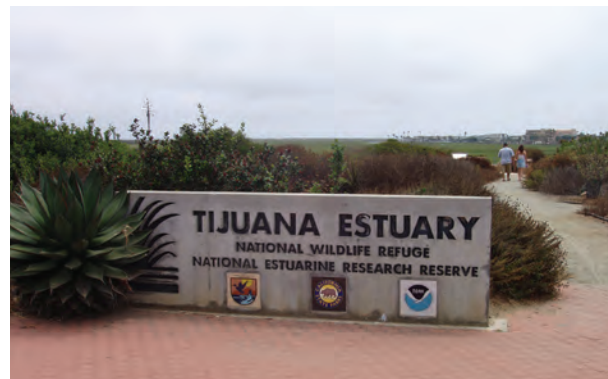
Entrance monument at the north end of the Reserve.