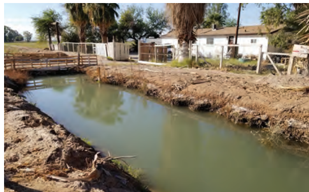
Unlined, open-air canals provide water for domestic use to rural homes in Imperial County.

The primary source of water in the Imperial Valley is the Colorado River. Over 3,000 miles of canals are used to convey water from the Colorado River to the area. The Imperial Irrigation District (IID) operates the canal system and supplies untreated water to city water systems, farmland, industrial sites, and households. In 2016, 2,758 households relied on untreated canal water to shower, wash food and dishes, and other domestic uses. 14 Because the water is untreated, domestic users are not allowed to drink or cook with the water and households served by canals must demonstrate proof of an alternate water supply that meets the drinking water standards described in Title 22 of the California Code of Regulations. Therefore, these connections are not considered “service connections” as defined by Section 116275(s) of the California Health and Safety Code and IID is exempt from public water system permitting requirements. Nevertheless, canals serving communities may run through agricultural and industrial areas and the potential presence of pesticides, fertilizers, and other contaminants is a concern. In this case, residents have commented that the water has a