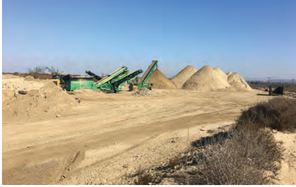
Goat Canyon sedimentation processing.

years through a California State Budget Change Proposal. In Fiscal Year 2016-17, the Department received a funding allocation of $1.8 million for each year through a similar process. In 2017, California State Parks worked on the 2017 sediment basin clean-out operation. This project allocated $900,000 for excavation of 40,000 cubic yards and haul-off of 32,000 cubic yards of deposition material.