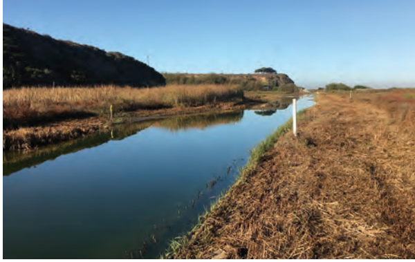
Monument Road flooded.

is also the location of Friendship Park, an area long cherished by the local community as a gathering place for people in the U.S. and Mexico to come together and meet at the International Border Fence.