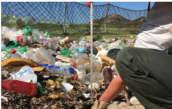
Measuring trash captured by the trash boom.

California State Parks maintains trash capture infrastructure in Goat Canyon, consisting of two lines of floating booms deployed across the creek channel. During the 2017 calendar year, California State Parks invested an additional $30,000 in trash capture system upgrades and coordinated additional improvements to the Goat Canyon trash boom infrastructure. With these upgrades, the upper boom is reinforced bank-to-bank with double boom infrastructure, including four feet of additional trash capture