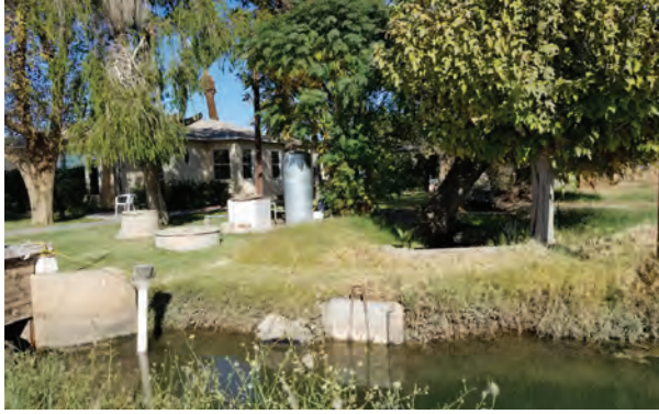
Unlined, open-air canals provide water for domestic use to rural homes in Imperial County.

foul odor, stains clothing, and has caused rashes in infants.