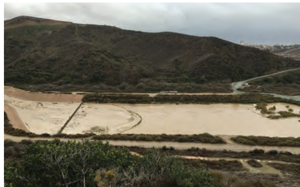
Goat Canyon sediment basin.

In Fiscal Year 2013-14, California State Parks received funding from the State Parks and Recreation Fund of $1,001,000 per year for three